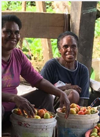
Strategies for Inclusive Markets: Lessons from PRISMA 3

Problem: low productivity and quality of vegetables = low incomes